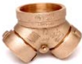
FIRE DEPT. CONNECTIONS