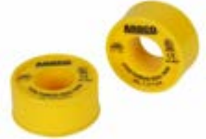
PREMIUM (1.0) DENSITY

Click Here to Purchase Download Tech Data Download SDS