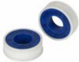
INDUSTRIAL (0.4 DENSITY)

When it comes to options, ARGCO has more options than most. Standard Density, High Density, or Premium Density Gas Tape. ARGCO offers it all, including domestic or import. So, if you have a specific need for a PTFE tape, ARGCO can supply the product for you.