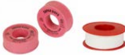
HIGH (0.8) DENSITY

Click Here to Purchase Download Tech Data Download SDS