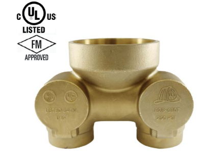
FDC STRAIGHT FLUSH INLETS

1-1/2" NST COMPLETE 2-1/2" NST COMPLETE with Plate and Plug