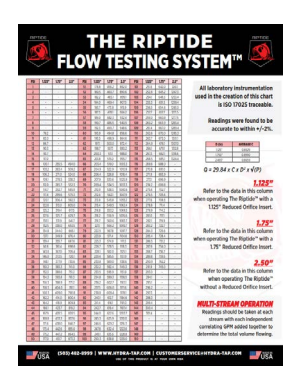
Click Here for Flow Chart User Guide