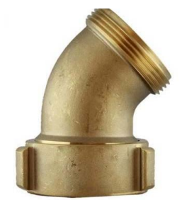
FLOW NOZZLE 45 DEGREE