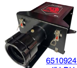
6510924: 4" LDH