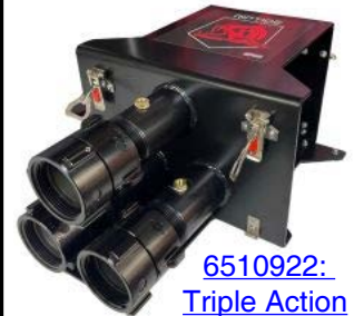
6510922: Triple Action