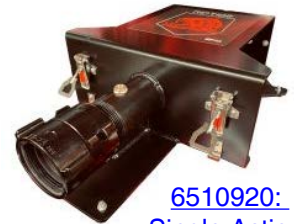
6510920: Single Action