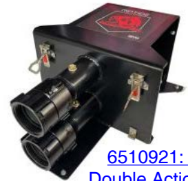
6510921: Double Action