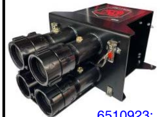
6510923: Quad Action